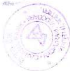
Authorised Officer, Canara Bank